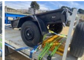
Outside entry 2- M Bieder