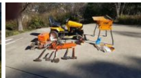
Outside Entry 1 - I Litchfield