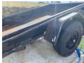
Outside entry 2- M Bieder