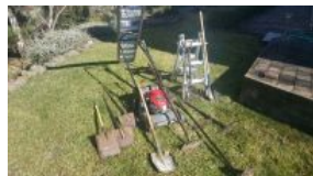
Outside Entry 1 - I Litchfield